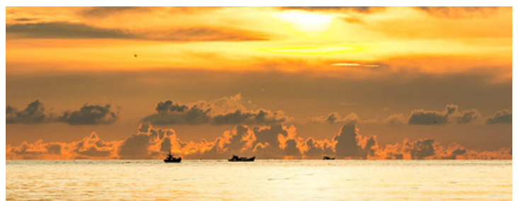
Tra Vinh, Vietnam