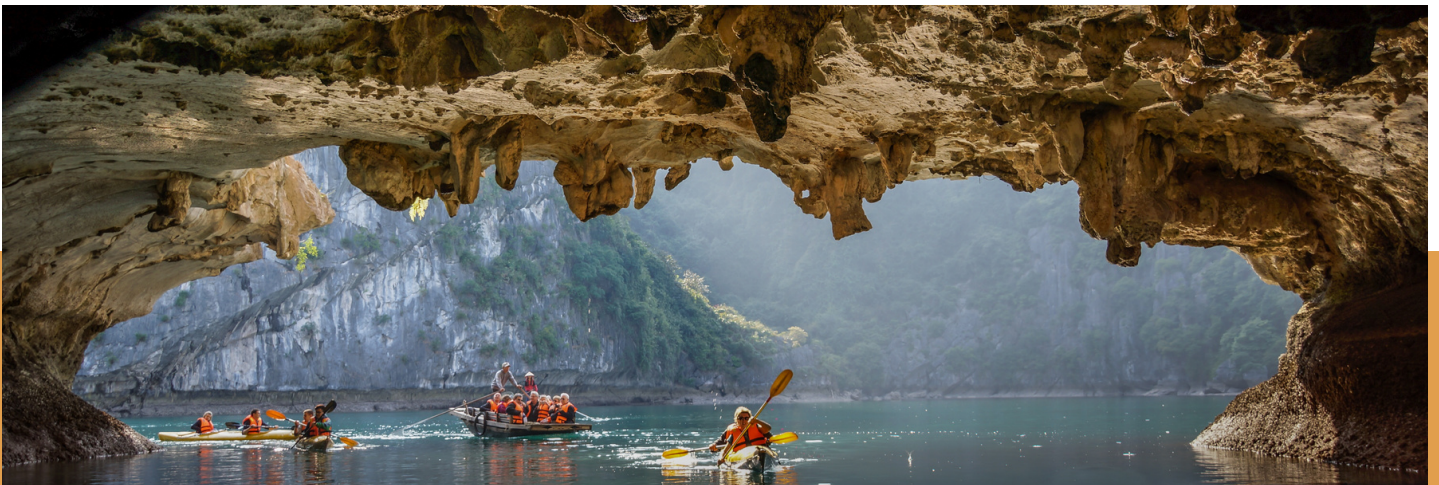
Bat Cave, Moc Chau