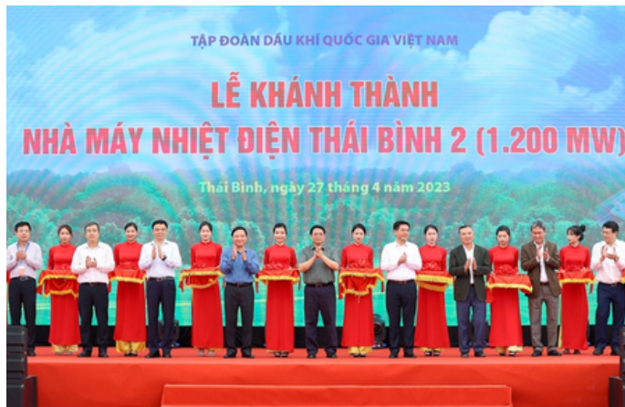
The inauguration ceremony of the Thai Binh 2 thermal power plant

Viet Nam put Thai Binh II, a two-turbine plant with a designed capacity of 1.200MW into operation on Thursday after 12 years of construction. This is among the biggest thermal power projects in the northern mainland.