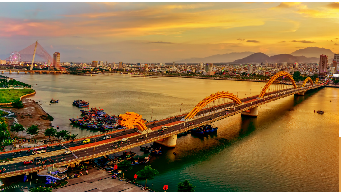
Dragon Bridge, Danang