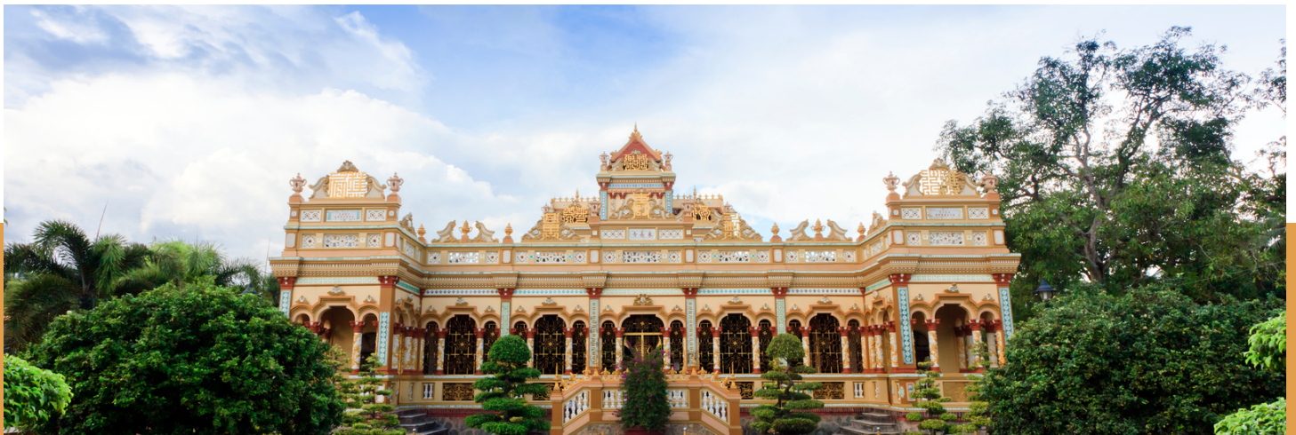
Vinh Trang Pagoda, Tien Giang