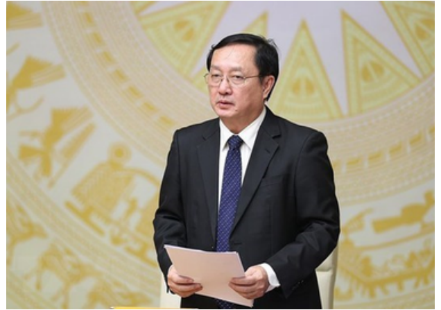
Vietnam's Minister of Science and Technology Huynh Thanh Dat

The minister said that resources will be focused on stepping up science and technology research, transfer and application to serve socio-economic development and security-defense protection, to speed up digital transformation, green transition and circular economic development.