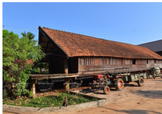
Ako Dhong Village, Buon Me Thuot