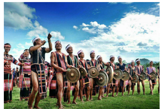
Buon Ma Thuot festival