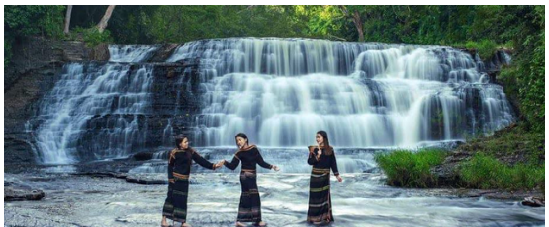
Thuy Tien waterfall, Buon Me Thuot

• Phone: 0091.11.2687.9868 • Fax: 0091.11.2687.9856 • Email: office@vietnamemb assydelhi.in