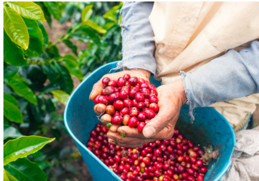
Buon Ma Thuot coffee

Buon Ma Thuot Coffee Festival has become a prominent event of Vietnam's coffee industry. On March 11th, 2023 there will be the International Trade Connecting Conference, a new activity to promote the value of the Buon Ma Thuot Coffee brand and affirm the position of Vietnam's coffee industry in the world's market.