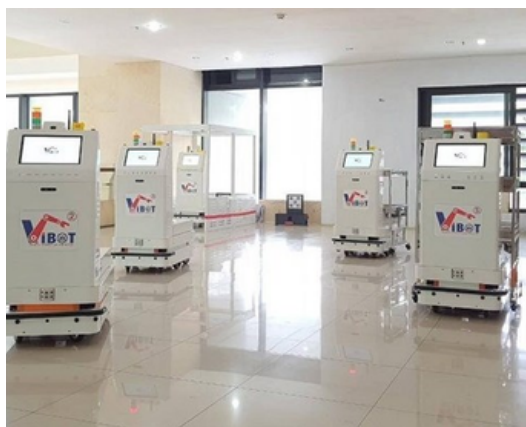
Medical robotic assistant Vibot

Vietnam climbed seven positions in the Government AI Readiness Index 2022, ranking 6th among ASEAN countries and 55th globally, as shown in the latest report issued by the UK's Oxford Insights, which ranked 181 countries this year, up from 160 in last year's iteration. This result not only reflects the development of AI technology but also shows the trend of forming the AI industry in Vietnam.