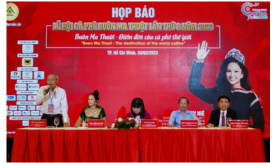
At the press conference

From 10th to 14th March 2023, the People's Committee of Dak Lak Province will coordinate with the Ministries and Central agencies to organize the 8th Buon Ma Thuot Coffee Festival in 2023 with the theme "Buon Ma Thuot – World Coffee Destination".